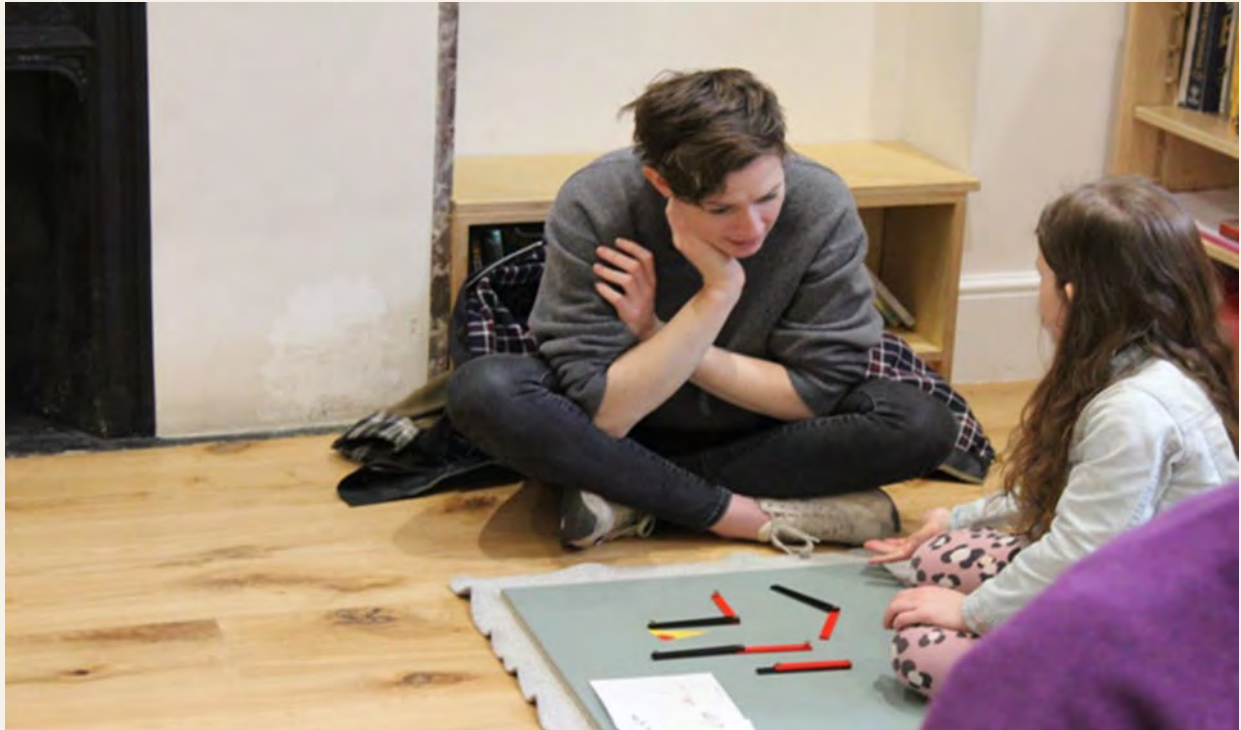
Exploring the concept of angles using the Geometry Sticks.

37 children and their families attended the Montessori Model United Nations in Rome in early May. The children and families found it to be a valuable experience and a wonderful opportunity for the children to participate in an international event and experience public speaking.