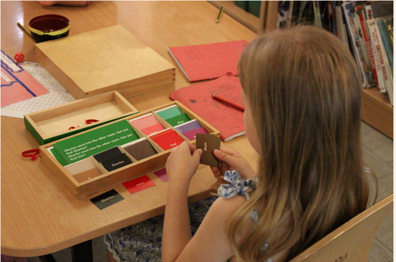
Working with the Grammar Boxes (above) and exploring the movement of the earth around the sun (below).