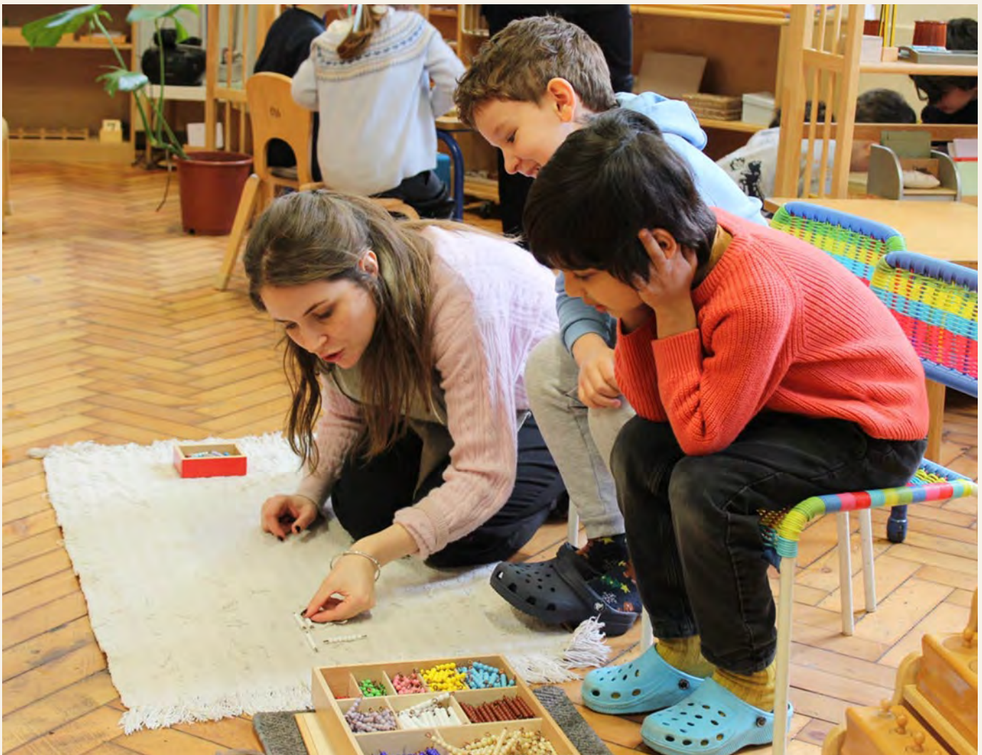
Building the multiplication table of 7.

This year we have developed a new website which we hope will help to increase awareness and understanding of Montessori as well as driving student and pupil numbers and providing an improved experience for the parents and students who use our site.