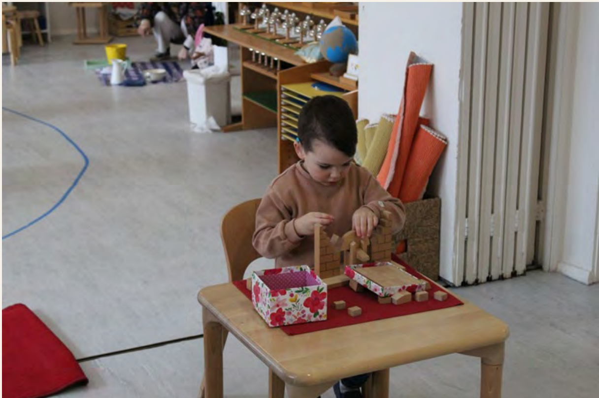
A child building the Roman Arch.

“Staff provide a nurturing and stimulating environment in which the school’s Montessori philosophy is firmly embedded.” OFSTED