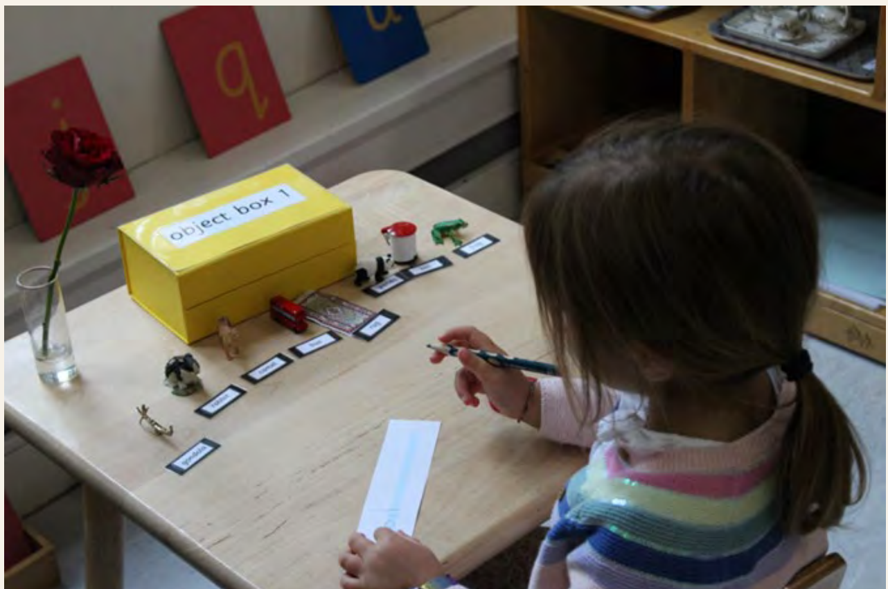
First steps in reading and writing.

We advocate for the right of all children to a quality education by increasing the number of teachers and adults trained to deliver child-centred Montessori education and in particular to expand ways of delivering education to those who have the least opportunities to access it. We do this not only through our teacher training and school but also by our commitment to offering teaching bursaries, training and teaching expertise to our historical partners in East Africa and other developing countries.